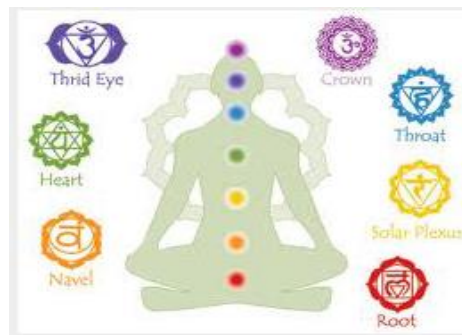
Figure 1: Hindu Chakras

Each of the seven main chakra centres in our body is represented by a colour (Harding, 2018). Around this connection, one can assign a whole world of meaning to each colour based on the chakra to which it is tied (Harding, 2018). The energy centres correspond with certain emotions and physical body parts. Recognising each colour’s meaning is useful when it comes to channelling colour in everyday life to manifest emotions and healing (Harding, 2018).