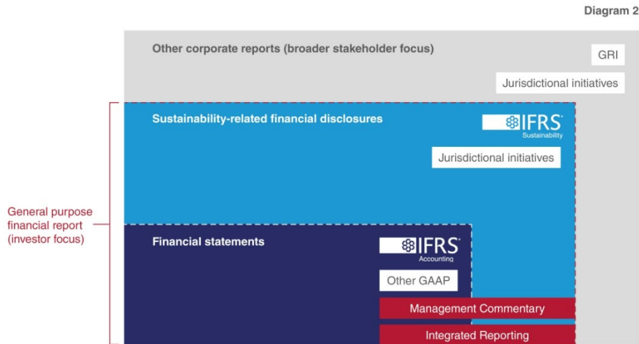
Figure 2: IFRS Foundation's conceptualisation of their scope compared to GRI (IFRS, 2023)

Foundation perceives its remit and definition of materiality to interact with the GRI and other jurisdictional initiatives.