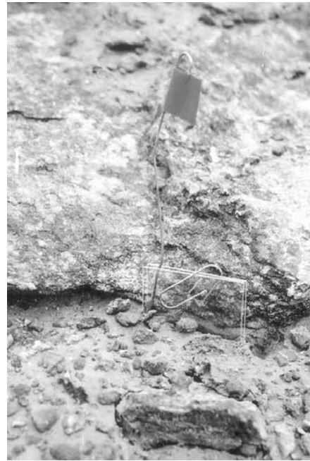
Fig. 1. Field deployment of glass slides bound with one clip and wedged apart with a second. Slides are inserted in soil or rock crevices.

rocks [4] and minerals [5] in the crater by cyanobacteria, most specifically by Gloeocapsa [4].