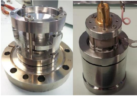
Figure 2: (left) High-speed (right) low-speed deployable Mass Spectrometer instruments