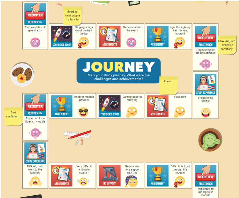
Figure 5.3: A student journey representation created in the Our Journey tool.

is structured by the student rather than the institution. Furthermore, unlike a survey, Our Journey is designed to be engaging and enjoyable for the student, with the potential to underpin reflective learning activities around study skills. Finally, options are being explored to integrate the tool, with prompts for guidance and support. We continue to iteratively refine the design, and to trial the tool in a variety of ways, in order to develop an evidence base and improvements.