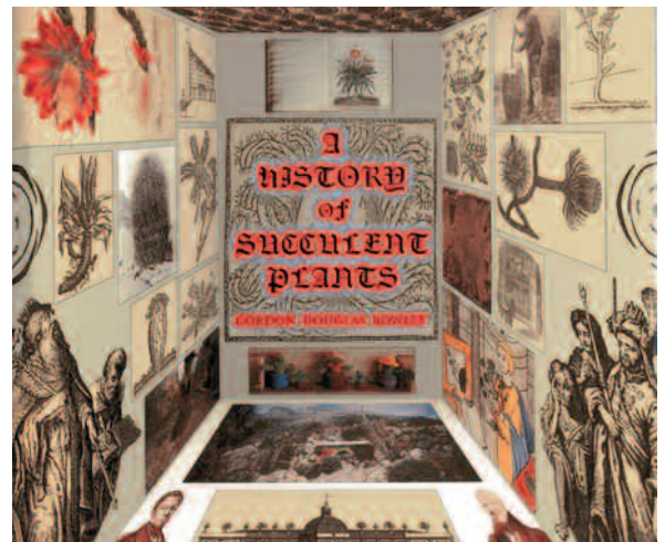
Fig. 3 Book cover. Strawberry Press, 1997

His vast outpouring of material on succulents grew from then on. He must literally have published many hundreds of articles on our beloved plants in numerous newsletters, journals, periodicals and yearbooks around the world.