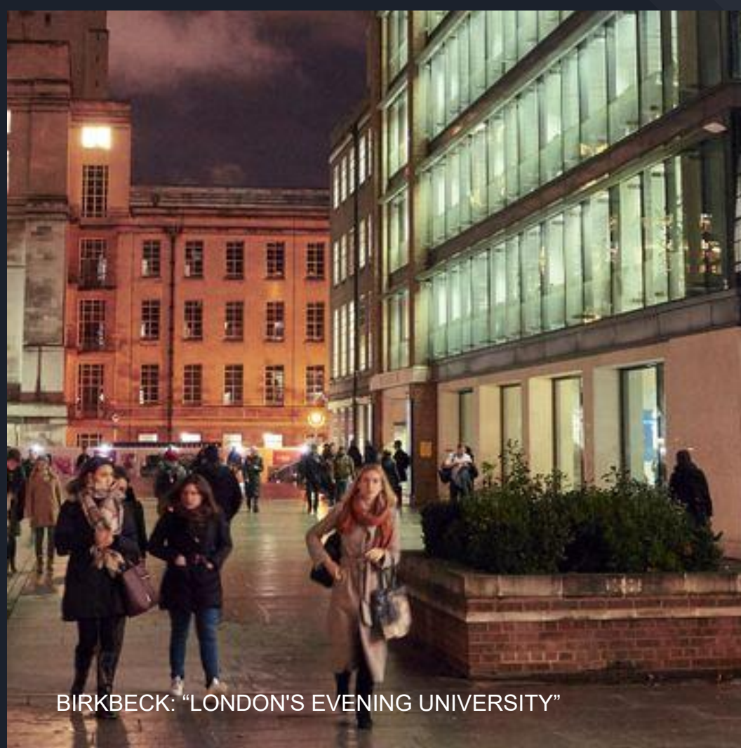
BIRKBECK: "LONDON'S EVENING UNIVERSITY"