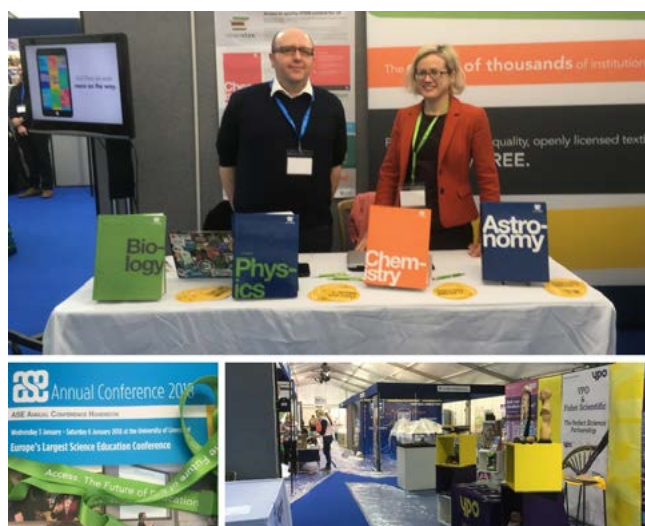
Image Credit: ASE Annual Conference 2018, Liverpool, UK (by Beck Pitt)