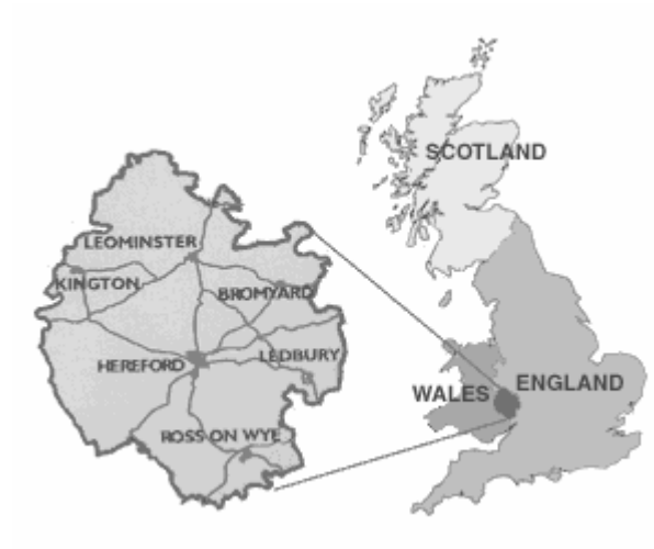
Figure 1. Location and county boundary of Herefordshire