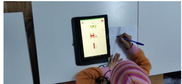
Figure 3: Child practising literacy at the digital learning space

The resulted designs, educational needs, and challenges from previous stages, were presented to the adult participants. We worked with them to prioritise the designs by mapping them with the available resources. In this case, due to the unavailability of teachers, the chosen outcome was a digital self-learning space at the camp using an available caravan and a set of tablets that were donated earlier but were not in use. The content was chosen to match the designs of the children to insure usability, and was assessed against the identified conflict sensitive topics such as violence and the aspects of engagement, motivation, and gamification literature. Evaluation sessions were conducted with children throughout the pilot and implementation phases to insure that the content and final design matches their expectations.