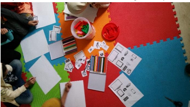
Figure 2: Children's co-design workshop

In the case study, the activities with children consisted of co-design workshops that involved drawing, LEGO, and modelling. We followed a similar sampling approach to the previous activities but with only three to four children at a time. Inspired by Fisher, Yefimova, and Yafi (2016), children were asked to create a "Magical Learning Machine". They were guided by questions to structure the activity, such as: What and will the machine teach you? Where would it be placed? Will you use it alone or with friends? How will teaching happen? We provided them with a diverse range of printed drawings of hard-to-draw technology equipment so they could include them in their design if they want.