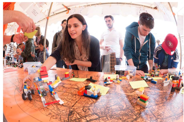
Fig. 1. Model London at Utopia Fair: building a future energy utopia with Lego and sticky notes.

In a second phase of the game, the opposing teams then collaborated to build the proposal (or an object representing the proposal) out of Lego, Plasticine and other building materials (Fig. 2). This object was placed in an appropriate location on a large-scale map of London that