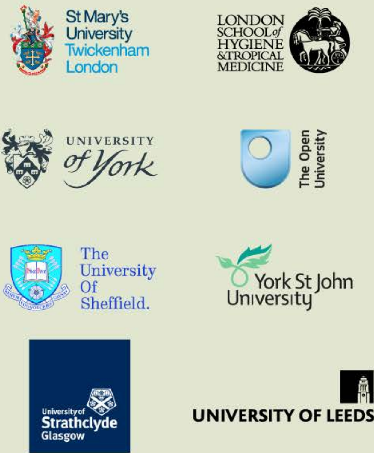
UK Repositories with recommender installations