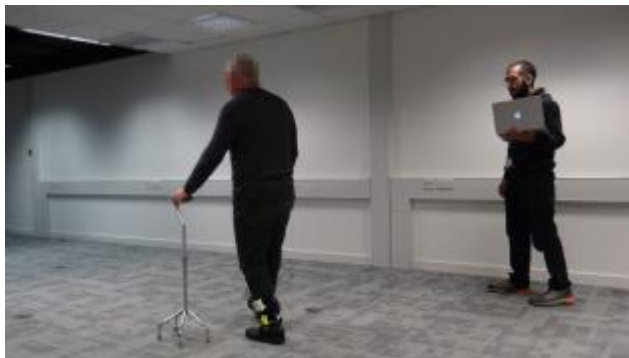
Figure 2 Participant walking with the Haptic Bracelets fitted on his legs