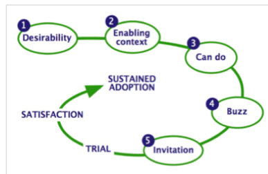
Fig 3. Five-Doors Theory adapted from [11]

Our assumption is that, by analysing these five conditions, we create an opportunity for users to acquire knowledge on the problem and possible solutions, to feel empowered to act, to invite other people and, hopefully, to sustain more pro-environmental behaviour. To perform this analysis, we associate types of tasks and features of the climate challenge as conditions in the 5-Doors model, and analyse how current users are grouped in this behaviour change process. We expect to identify aspects of the game that should be considered to boost this process.