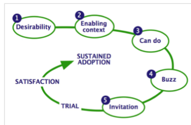
Fig 3. Five-Doors Theory adapted from [11]

Our assumption is that, by analysing these five conditions, we create an opportunity for users to acquire knowledge on the problem and possible solutions, to feel empowered to act, to invite other people and, hopefully, to sustain more pro-environmental behaviour. To perform this analysis, we associate types of tasks and features of the climate challenge as conditions in the 5-Doors model, and analyse how current users are grouped in this behaviour change process. We expect to identify aspects of the game that should be considered to boost this process.