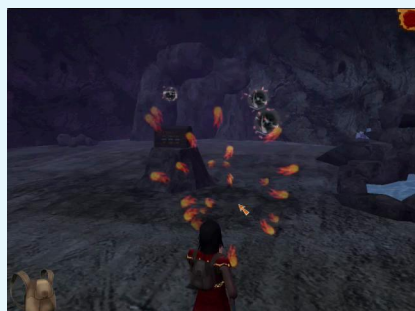
Trailer showing SPARX in action

Video on bmj.com (see also http://bmj.com/video )