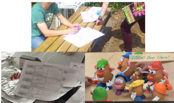
Figure 2: From storyboard to film production

Studies have been completed in Milton Keynes, UK; Madrid, Spain; Vaxjo, Sweden; and Portugal. The performance metaphor has also been used to guide international partner collaborations and public engagement with the project.