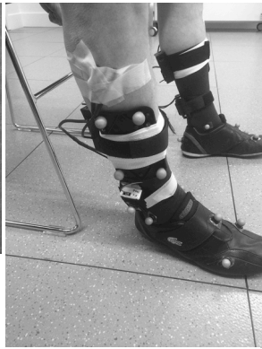
Figure 2. Participant wearing Haptic Bracelets and optical tracking markers (see text).

explored and experimented with, in order to provide ideas for new conceptual development and interaction design.