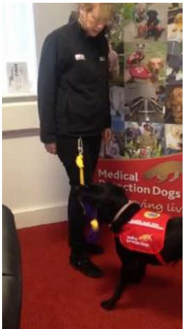
Figure 2. Pulling on the interface until it the 'tuggy' detaches will trigger alarm software.

variety of different tasks, including opening doors, helping load washing machines, retrieving fallen items, and even using ATM machines. I am investigating the potential of technologies that can support these dogs and others like them in their task of looking after their owner and exploring how specific designs might be able to help. In developing such technologies, my work seeks to explore the following research questions: