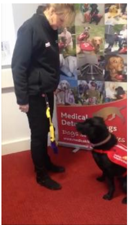
Figure 1. A dog learning how to interact with an on-the-body emergency alarm prototype.