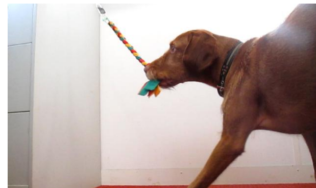
Figure 4. A dog pulls on a hanging mounted detachable interface.

Designing for non-human users presents unique challenges. For one thing, non-human animals have sensory, ergonomic, cognitive, and cultural characteristics which may be significantly different from those of humans. For another thing, there is the difficulty of using verbal communication, so often relied upon by interaction designers in the design process. My research seeks to further a paradigm shift whereupon designers do not merely design for a user with "special" needs (such as paws instead of hands), but rather with them to identify what the users themselves "want" from a particular interface. As an initial approach to find this out, we explored the idea of ethnography for requirements elicitation, a research methodology that uses observation, interviews, and co-location to understand user requirements [2, 3, 8]. More specifically, we explored the idea of multi-species ethnography, used to study mixed species environments [9] (in this case, dogs and humans sharing working and living environment.)