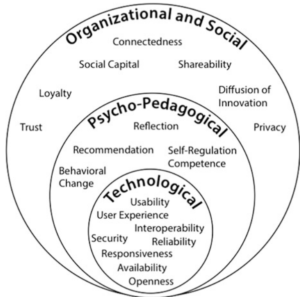
Fig. 2 The “TOPS” integrated evaluation framework for PLEs

The constructs highlighted within the three circles are high-level concepts, which should be translated into low-level variables, selected from the review brought forward in the previous sections. Operationalizing and estimating such variables with particular techniques and tools leads to results, which can somehow and somewhat account for the extent to which PLEs successfully enable users to attain their learning goals. For instance, the construct usability is translated into two