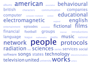
Figure 2.1 Top Topics across Facebook groups

and super users, which are the most active and engaged roles. The application allows monitoring the role composition over time for all Facebook groups as well as monitoring the behaviour of individual users. For a particular user the application displays her role path (the different roles that the user adopts over time) in all Facebook groups where the user has participated. Studying the user's behavioural paths can help us to detect particular patterns that students follow before dropping or losing interest about course. Note that each of the studied Facebook groups is linked to a particular OU course. To obtain information about the course, therefore complementing the results of the analyses, we make use of the OU's linked data portal ( data.open.ac.uk ). Using different SPARQL queries we can obtain information about OU courses, their title, description, available locations, required level and categorisation, among others.