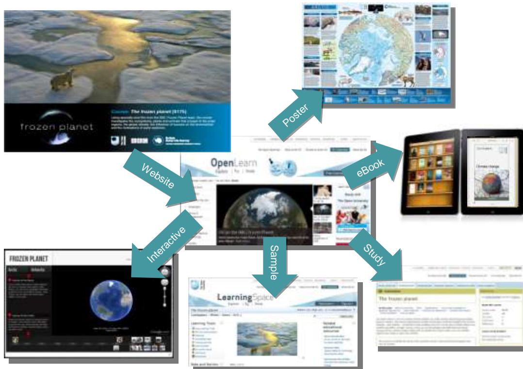
Figure 1 Frozen Planet: An example of the interrelated items of open engagement around a single open media campaign starting with the TV programmes

The level and sometimes depth of public engagement in just this one campaign around Frozen Planet in early 2102 is evident in that viewing figures for the broadcasts was 10.8 million each