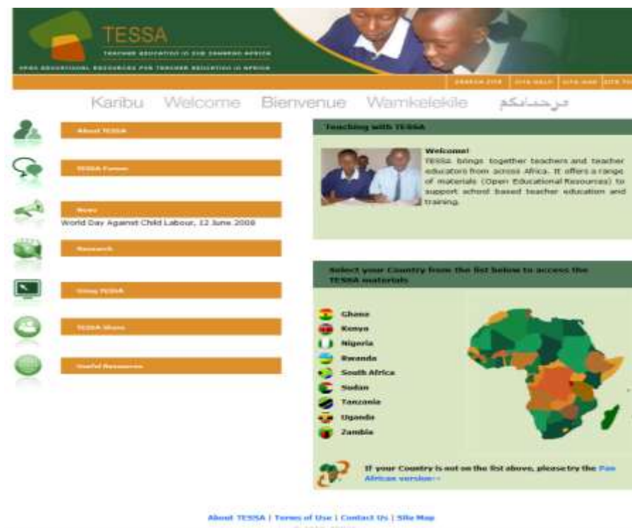
Figure 1: Screen capture of TESSA portal landing page in 2008

which aimed to: create a bank of ‘open content’ multi-media resources in on-line and traditional text formats that will support school based education and training for teachers working in the primary education sector; develop ‘open content’ support resources for teacher educators and trainers who will be planning, implementing and evaluating the use of the resources developed above; effectively extend and widen the take-up and use of the TESSA resources and ideas across SSA; and implement research activities that would promote the improvement of teacher education generally, in particular school based teacher education in SSA. The programme was established as a result of more than ten years of co-operative partnerships undertaken through a variety of projects that were consolidated to form TESSA’s founding consortium partner network of 16 institutions in 9 countries. By the end of the initial phase, over 100 academics and over 1,000 teachers had been involved in the design of the programme. The bank of open content resulting from all this activity was accessible through a portal (Figure 1).