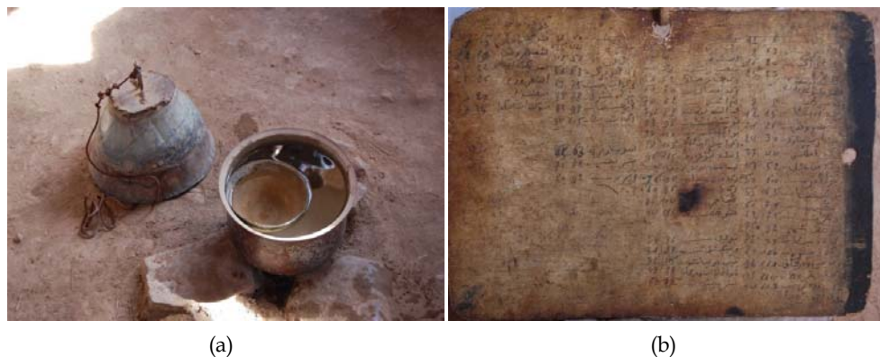
Fig. 3. a) Water clock in Southern Morocco – it takes 45 minutes to fill the pot, time used as an irrigation unit; b) List of benefiting water users

Water conflict management techniques were also developed in towns, such as Fes, where water circulated through a 70km long network of canals and was regulated by a corporation of specialists called the qanawiyyum .