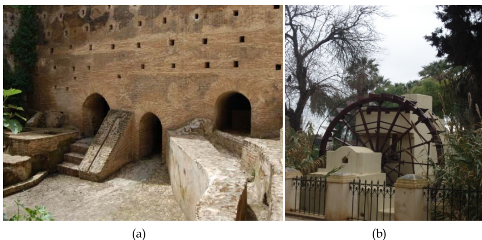
Fig. 5. a) Water distributor, Fes b) Noria from which the water flowed to the distributor

The infrastructure was based on a system of underground tunnels and surface canals where water flew simply following gravity, down through the old town, the medina. There was also the network of spring water, the drinkable water, linking some twenty springs around the old town into a pottery canals network called the maâda , feeding seventy fountains for public water use, as well as private houses. Finally the water sanitation network was organized underground through the Sloukia which took the water outside the city towards the Oued Sebou. At the time when that structure was built, the network was sufficient for the population it served and the wastes led outside were sufficiently rapidly biodegraded. The various infrastructures and the architectural attention that was paid to them showed how much water was valued. Economically, a fair allocation of water resources was ensured thanks to a careful management of the volume being directed towards various types of activities. Spiritually, water was beautifully present in fountain and ablution rooms of mosks. Environmentally, water was used carefully and recycled as much as possible (e.g. the water from fountains was re-orientated for it to be re-used in gardens) before it was got rid of.