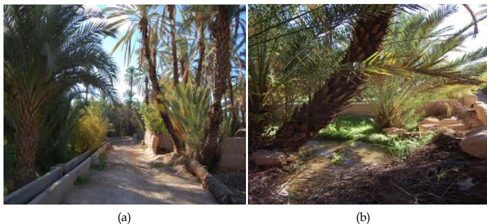
Fig. 2. a) Cement seguia ; b) Natural seguia in Tata, Southern Morocco

Traditionally, another system of, this time, surface water distribution, is well known in Morocco and still in use: it is the system of seguias , main system of collect, distribution and transfer of water. In the Haouz plain, 150000 hectares of land are irrigated by a system of 140 km of seguias and 1000km of smaller canals derived from the seguias (the mesref ). The seguias are organized in the shape of fish bones, with the seguia itself, deviating water from the river, to the mesrefs , distributing water much further from the oued (river) to the fields to be irrigated. The loss of water through infiltration can be very high (up to 50%), but it ensures that there is still water to be captured downstream – since little dams upstream capture the majority of available water. In order to avoid conflicts over irrigation, an alternative system of seguias irrigation to the left and to the right of the river is put in place. This distribution