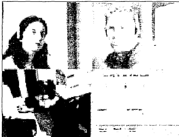
Figure 1: The four-way matrix comprising four different video screens with two subjects, the observer and the computer simulation screen

We analyse our records by looking at a verbal protocol and by relating utterances made by participants to both events in working with the computer and any non-verbal communication.