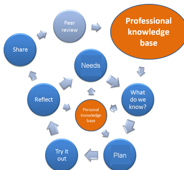
Figure 4 The Vital Practitioner Research Cycle

A key element of research (including practitioner research) is that it involves the sharing of expertise. This is illustrated in Figure 4 which shows the Vital Practitioner Research Cycle