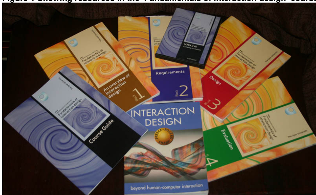
Figure 1 Showing resources in the 'Fundamentals of interaction design' course

The media types in the original section of course material include: