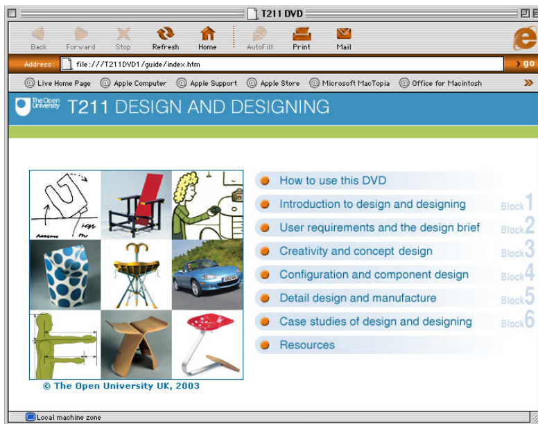
Fig 1 The Main Menu page showing the main themes of the course and DVD. This menu enables the student to access all areas of the DVD. The navigation has been kept as simple and straightforward as possible and, for usability reasons roll overs and image maps have been avoided.

The resulting DVD uses a simple html interface and is structured around the themes of the teaching texts. There are six main themes, Design and Designing, (which includes an introduction to drawing and modelling), User Requirements and the Design Brief, Creativity and Concept Design, Configuration and Component Design, Detailed Design and Manufacture and Design Case Studies.