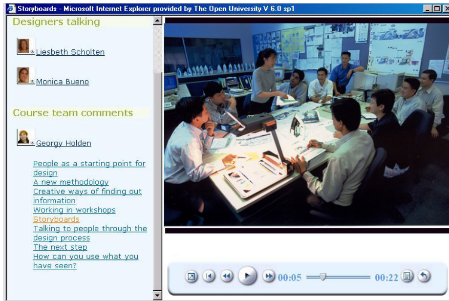
Fig 3 The video interface showing a tree menu that appears when one of the buttons in the side bar is selected, in this case " Course Team Comments."

To assist students the DVD can also be played on a television using a DVD player using a simplified text interface.