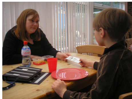
Figure 1: a PECS symbol exchange. Herring (2009)

Children with autism demonstrate deficits in language and communication, social interaction, thought and behaviour. Various pedagogical approaches are commonly used to support communication development, one of which is the Picture Exchange Communication System (PECS) (Preston & Carter, 2009). PECS is a simple, physical symbol-based communication method used by teachers to develop communication and social interaction in children with autism (see figure 1, below). Such children are often diagnosed pre-school, but are rarely introduced to PECS until after they begin school at around four to five years of age. This delays language and social development with accompanying behavioural problems associated with the condition.