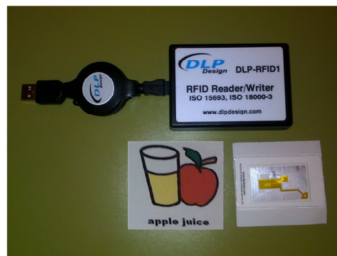
Figure 3: RFID reader and RFID enabled symbols

CAPE is also equipped with RFID-enabled physical symbols similar to those used in PECS. RFID enabled symbols used in conjunction with an RFID reader (see figure 3) allows CAPE to simulate the physical exchange of symbol tokens used in PECS pedagogy (see figure 3, below). In response to prompts from the virtual teacher, the child chooses and places symbol tokens on an interface board and CAPE responds to this selection.