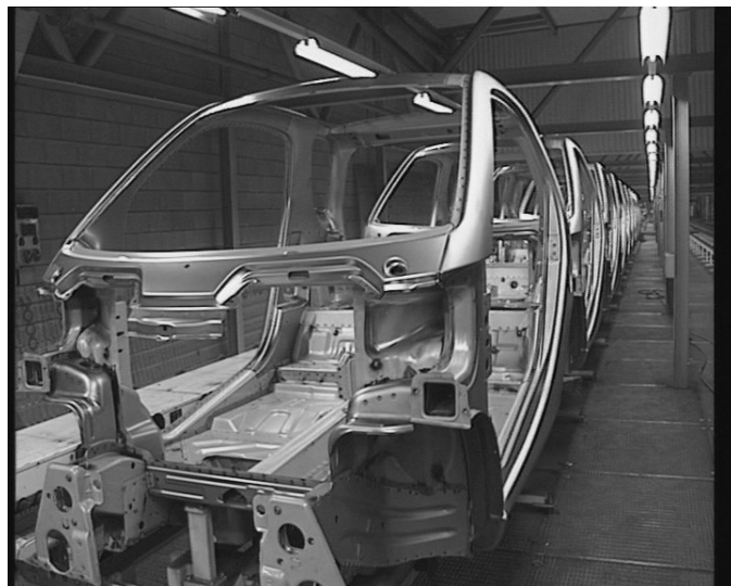
Figure 15.2. The Tridion safety cell, after complete assembly at smartville by a main 'system partner', Magna Chassis. Here, it is being conveyed to the main fortwo assembly line.

The car was originally envisaged as a second car and as largely for city use. But it has also been associated with initiatives that seek alternative approaches to individual mobility in urban areas. These include reduced public transport fares for inter-modal journeys, reduced parking fees, preferential car rental agreements, incentives for car sharing and for using cars like the fortwo outside the prevailing owner-driver model (Mildenberger & Khare, 2000). In some parts of the EU, these initiatives have started to emerge – for example, in the case of the fortwo, in lower charges for parking and for car-wash (this reflects lower use of water, detergents etc.). The fortwo thus potentially contributes to reducing impact from personal vehicle use. So far, this potential has been limited by both the limited scope of incentives and the low sales figures shown in Table 15.2.