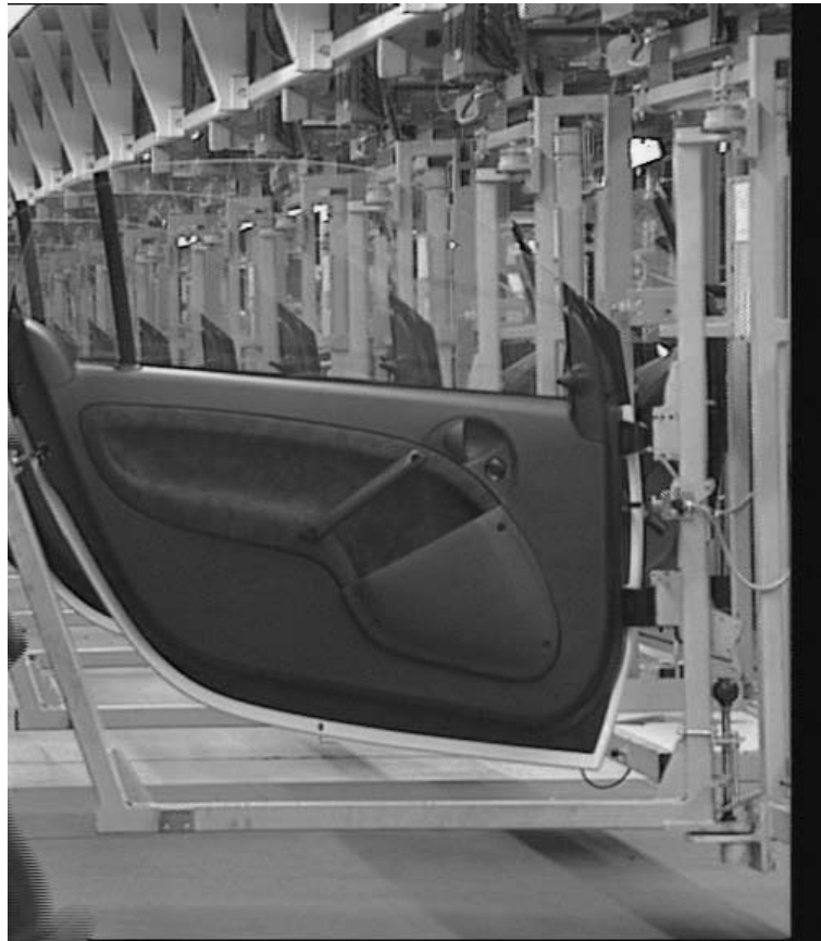
Figure 15.3. Detail of the left-hand-side door interior, showing fittings

Doors where they are configured as part of a complete door module (which include trim, glass, mirrors, door-mounted controls, window and mirror motors). Operations in these three supplier facilities are tightly coordinated – with each other and with the main assembly line. Complete door modules are supplied via an enclosed link bridge, in pairs that match the build-to-order (BTO) specifications for interior and exterior colour choices and other variants. There is consistent emphasis on a very high standard of conformance with quality standards at all production stages, maximizing efficiency in the use of energy and materials. Large scale reductions in packaging waste and in transport-generated emissions become possible when components can be made locally. One estimate is that more than 95% of the transport costs for the main modules have been reduced compared to a typical automotive assembly plant (Treneman, 2001).