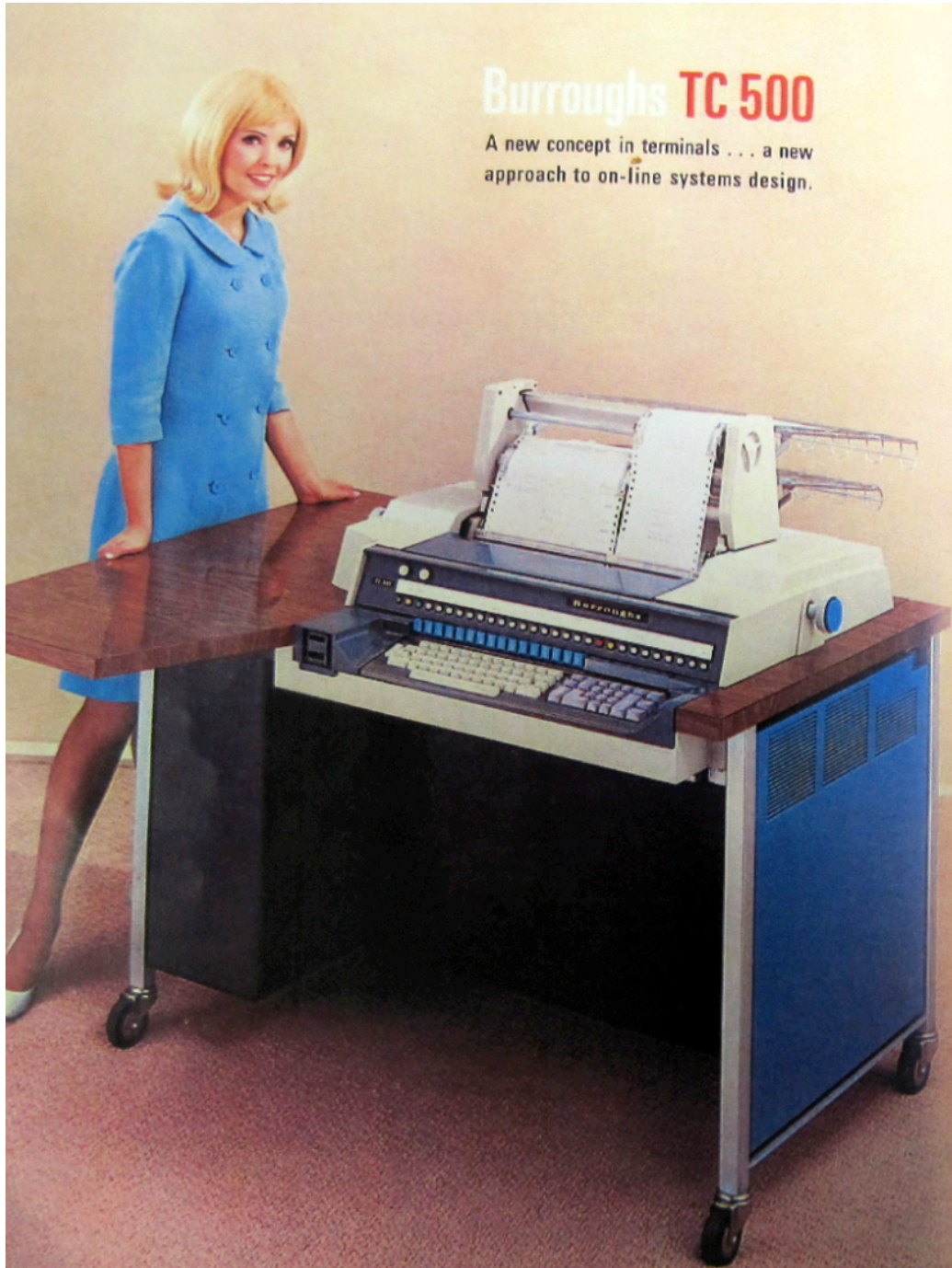
Figure 2. A Burroughs TC 500.

Burroughs had long been developing accounting machines for the banks, and they had become increasingly sophisticated. Its Sensimatic machine, launched in 1950,