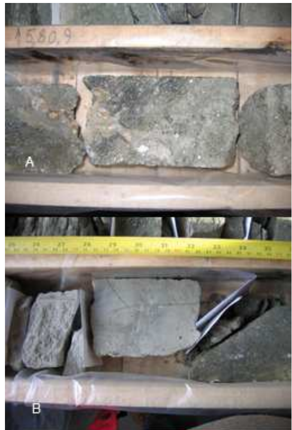
Figure 1. Images of core material recovered from the Boltysch impact crater. (a) Suevite breccia from a core depth of 580.9m and (b) Contact between suevite breccia and overlying lacustrine sediments at 581.5m.

The first sediments to be deposited in the crater lake occur at 581.5m and comprise a series of thin turbidite beds overlain by progressively more organic-rich shales and occasional oil shales. These sediments span a period of up to 10Ma and contain occasional macrofossils, including ostracods, fish and plant fossils. Preliminary palynological studies suggest that initial sedimentation rates in the crater following the impact may have been low followed by more rapid sedimentation through the Late Paleocene.