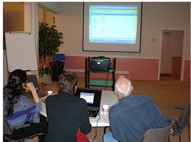
Figure 1: Informants preparing their large group exercise

The tasks were conducted in face-to-face meetings. We divided the informants into groups of 3-4 participants. Each group was given about ninety minutes to prepare (see Figure 1). Some groups included a more experienced practitioner, who was allowed to help design and prepare the exercise but not to play an active part during the large group exercise itself. After the preparation period, each group took turns introducing and conducting their session with the larger group of participants. Typically each group had one person acting as the mapper (hands on the keyboard/mouse controlling the Compendium display) and one as facilitator (guiding the discussion from in front of the room). Each group had fifteen minutes to conduct their session, followed by a debrief discussion in which they also received feedback from the larger group. After the sessions, all informants completed a questionnaire that asked questions about their background with Compendium and related tools, as well as about the sessions themselves.