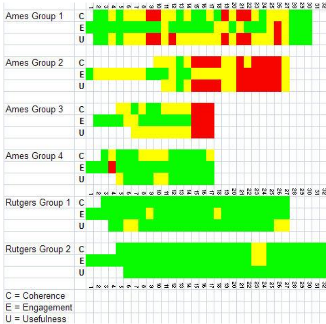
Figure 2: Heat maps from CEU analysis

(High ratings, green shading) drop to 2s or 1s (Medium (yellow) or Low (red)), indicating something went wrong. In turn, a few sessions kept High ratings throughout, indicating that the preparation as well as execution of the session (design and realization) was well thought out and handled in practice.