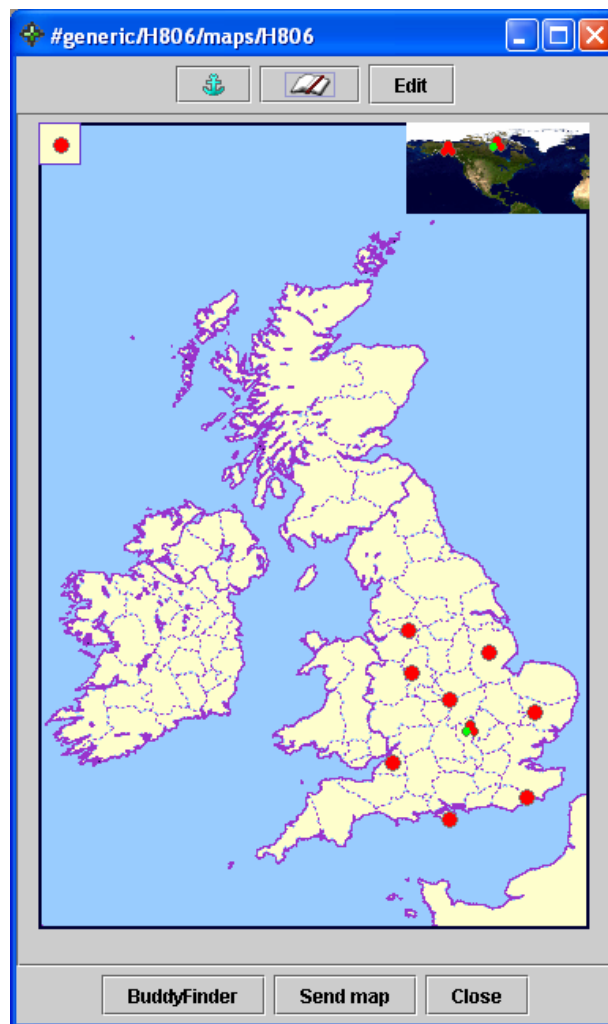
Figure 1: BuddySpace location map

In order to give students the opportunity to work together on complex formative assessment tasks we added other features to BuddySpace. These features allow users to add details of their expertise and interests into a database so that other users could find them in order to seek out their expertise on a variety of topics and to 'yolk' PCs together so that two students could see and synchronously interact with a software simulation. Hence BuddyFinder and SIMLINK were developed by IET and KMi.