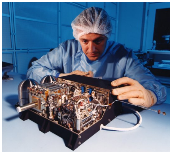
Fig 2 shows an Open University scientist working on 'Ptolemy', the advanced and miniature chemical and isotopic analysis laboratory currently flying on board the ESA Rosetta lander Philae.

Ptolemy will provide chemical and isotopic data for a number of extant species, for atomic masses 10 Da to 140 Da, including the D/H, ^{13}\text{C}/^{12}\text{C} , ^{15}\text{N}/^{14}\text{N} and ^{18}\text{O}/^{16}\text{O} ratios, present in volatile and refractory materials in the upper 250 mm of the nucleus' surface [8].