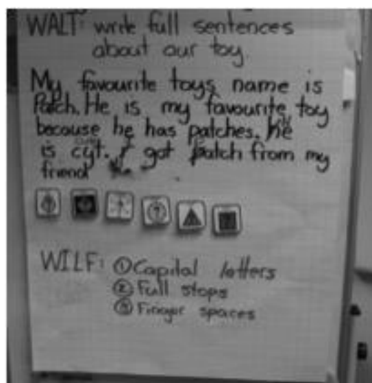
Figure 1: The schooled expectations for the task

Below (Fig. 1) is a photograph of the text the teacher produced with children to demonstrate these expectations: