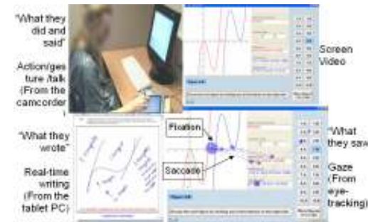
Figure 1: Examples of action, writing, screen and gaze videos

Digital approaches to capturing, coordinating and analysing what the learners said, did, saw, and wrote was recorded digitally and time-stamped so that it could be viewed and analysed as a coordinated whole. The techniques take advantage of the latest analysis software that facilitates synchronisation and encoding of multiple video feeds, eye gazes, handwriting, and verbal transcripts (Figure 1). Utterances and action were captured, using a digital camcorder, as an indication of thought processes that might be occurring; real-time writing and sketching were captured with a tablet PC, to identify additional representations being used; and gazes were captured using an unobtrusive eye-tracking device, so as to identify objects of attention [5].