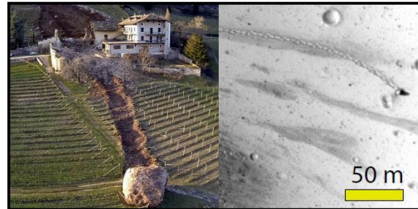
Figure 1. Left: A terrestrial rockfall example, Italy, 2014. Right: Rockfall example with a well-preserved track and 10 m wide clast. HiRISE image ESP_037190_1765.

Methods: We mapped the tracks left by rocks falling or bouncing from exposed outcrops in 45 impact craters in the equatorial to mid-latitude regions of Mars using Mars Reconnaissance Orbiter (MRO) High Resolution Image Science Experiment images (HiRISE) at 25-50 cm/pixel. Impact craters are widely distributed over the martian surface and can be used as sample sites to test the different factors controlling rockfall. Conveniently, they are circular and therefore allow an assessment of the influence of slope-orientation with respect to the sun. Here, we focus on relatively small (<10 km) and fresh impact craters (Fig. 1A) to reduce the influence of slope-inheritance from other long-term processes. To exclude that the observed trends are simply a function of asymmetries in slope steepness, we compared our rockfall distribution to slope angle for a subsample of 11 craters with 24 m/px Digital Terrain Model (DTM) derived from MRO Context camera (CTX) stereo-pairs using Ames Stereo Pipeline [8].