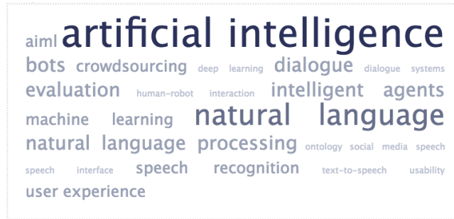
Figure 2. Most common authors’ keywords used in the papers addressing user studies

The fact that the authors’ keywords not always properly represent the focus of the paper is acknowledged and can be considered a limitation of this analysis. But as a “thermometer” of the research domain, the word-cloud evidences the predominance of studies addressing aspects of Artificial Intelligence and Natural Language Processing when compared to more HCI-related topics like ‘user experience’ or ‘usability’. Other terms suggesting more specific studies on users’ perception, impact, adoption, etc., were not revealed.