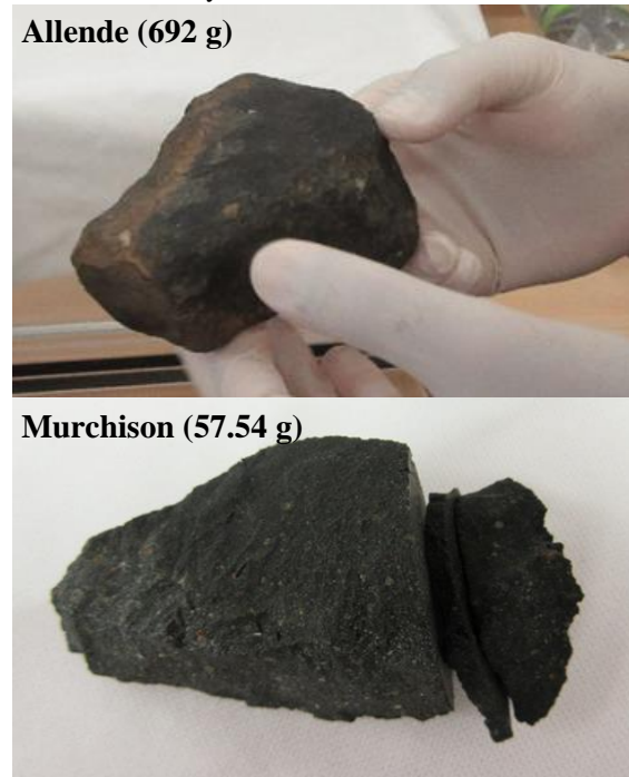
Figure 1: Stones of Allende (CV3) and Murchison (CM2) as purchased for this work

of material left intact for curation and future processing and scientific analysis.