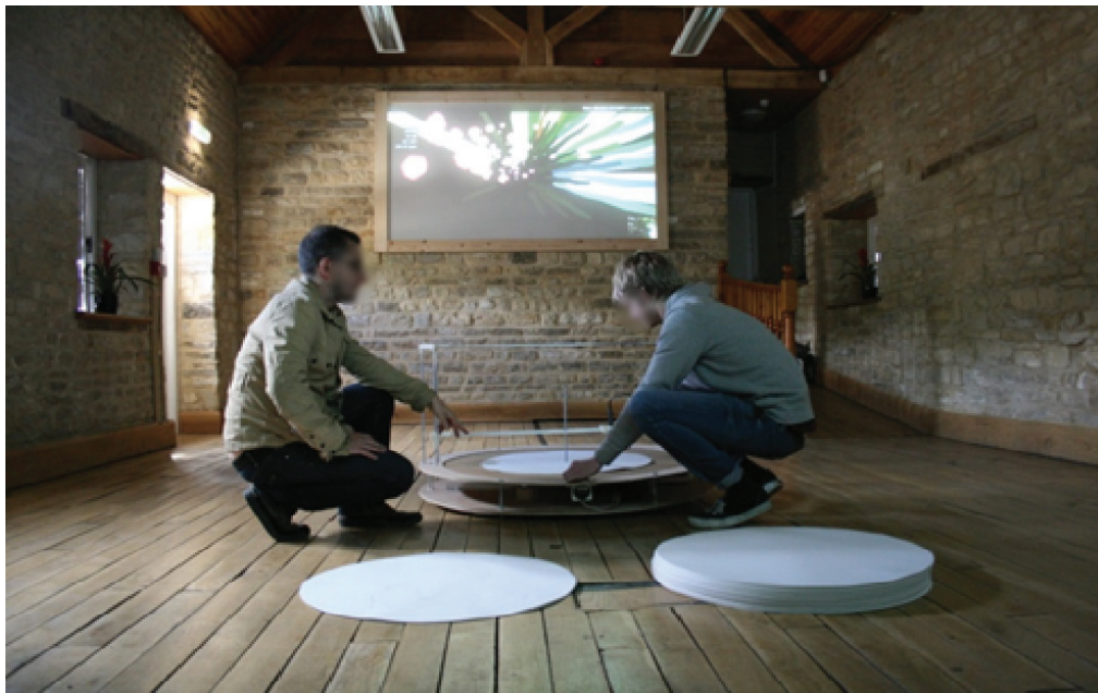
Figure 1. A Conversation Between Trees: one of the large screen displays (on wall) and the climate machine (on floor) (used with permission © Active Ingredient 2013)

Thirdly, visitors to the art installation could choose to go on a walk in one of the forests used in the UK venues, taking with them a mobile phoned loaned by the project, which takes photographs of the trees every 10 seconds. The intention was for the visitor to act as an additional ‘sensor’ and the photos collected by them were subsequently combined with data from the local tree and transformed into visualizations on the phone, employing the same approach used to combine and visualize data on the large screen displays back in the gallery space. In addition, visitors could listen to a narrative created by the artists to provide their perspectives on a walk through the forest. Visitors were also asked to estimate and upload environmental levels of sound, humidity, air quality and light on a scale from 1-10 and to also provide three words to describe their feelings at the time, which were all uploaded to the main server.