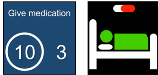
Fig. 2. Two different glyph designs for Hospital Scenario

form factor afford us to utilize them as placeholders for spatially distributed situated glyphs. However, currently available displays are not capable of providing all functionality required for our situated information system. These requirements are: