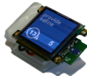
Fig. 3. Micro display prototype with a physical size of 51mmx30mm

As mentioned above, our major design issues are low energy consumption and wireless connectivity. For high-resolution display devices that are always on, power consumption of the display is the crucial parameter. Organic LED display technology features low energy consumption, wide viewing angles and improved brightness when compared to other display technologies and has therefore been chosen as the basis for ambient displays. Wireless connectivity is provided by a separate microcontroller with embedded ZigBee -IEEE