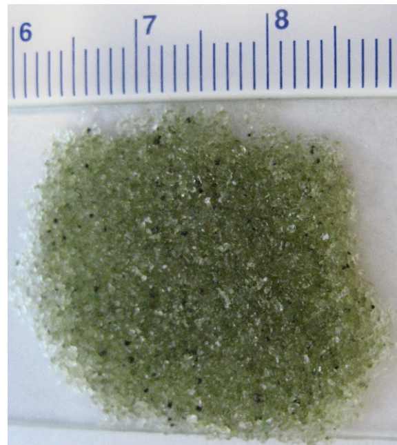
Fig. 3. Glass slide sample of glued peridotite powder from the 250 µm to 500 µm grain-size fraction. Green grains are forsteritic olivine and black grains are spinel mineral phases.

composition. This modelled composition can then be compared to the sample's known bulk composition (measured using ICP-MS at the Natural History Museum). This comparison will then enable us to verify the reliability of the C1XS XRF code.