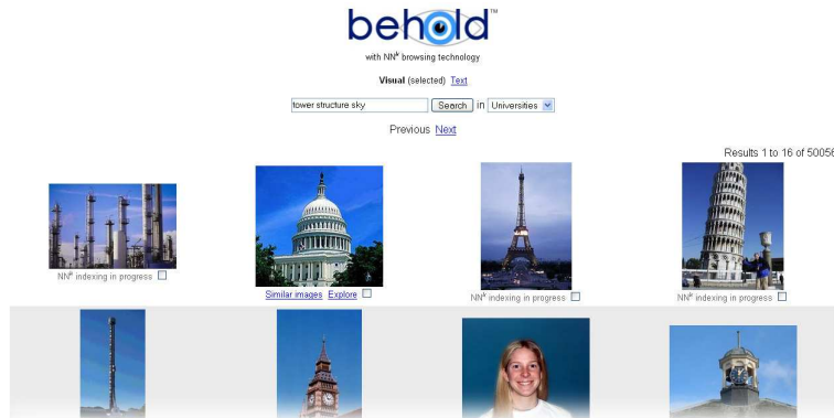
Fig. 1. Initial search using keywords (query: ‘tower structure sky’)

The search engine is implemented within the JavaServerPages framework and is served using Apache Tomcat 1 . Figure 1 shows the result of a query ‘tower structure sky’. Below each image there are two links, one for using the image as a starting point for exploring the NN^k network and the other for viewing different clusters to which the image belongs. Figure 2 shows two steps in the image network after the second search result from the left has been selected as the focal point.