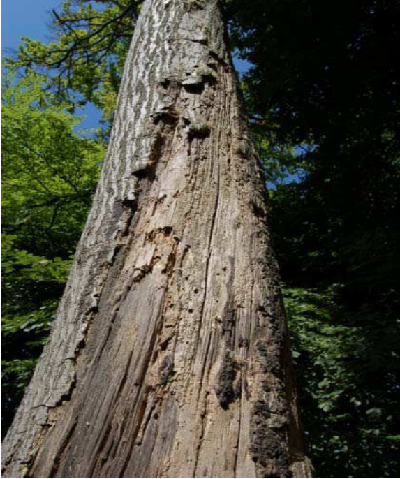
Figure 3. Standing dead ash Fraxinus excelsior trunk – valuable habitat for solitary bees and wasps

exclosure was cleared of bramble Rubus fruticosus and ash seedlings and the ground lightly scarified by hand-raking to remove the cut material and accumulated leaf litter.