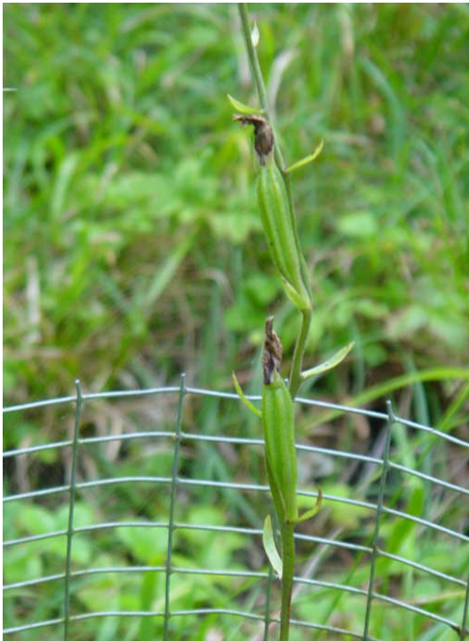
Figure 2. Two seed pods on Plant D, lower (D5) at 36 days and upper (D8) at 34 days after pollination, 1 August 2007

In past years some flowering and non-flowering spikes (and associated seed pods) have been lost due to grazing by muntjac Muntiacus reevesi , even though plants were partially protected by wire mesh cages. This situation has now been rectified with the installation of a wire mesh fence. No loss or damage to pods via insect herbivory has been noted, although damage to plants by slugs has been apparent in some years. Steps are being taken to prevent this, including the placement of copper rings around plants, to protect them from slug herbivory (Newman & Showler 2007).