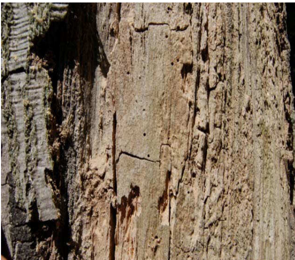
Figure 4. Small boreholes in a dead ash Fraxinus excelsior tree used as nest locations by Chelostoma campanularum

Long-term conservation: There has recently been extra attention given to conservation of red helleborine in the UK. As well as ongoing habitat management, seed has been collected over recent years: some has been banked at the Millennium Seed Bank at Wakehurst (part of Kew Gardens) in Sussex, southern England; some has been used for DNA analysis of the UK populations; and some has been used for propagation purposes. Botanists at Kew and Natural England are continuing to research improved methods of germination and propagation (as yet unsuccessful) with a view to producing plants that may be used for reintroduction purposes.